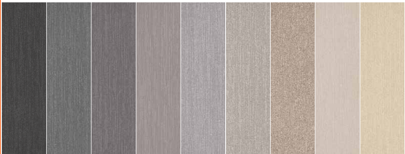
NORSE DYLAN 100 NORSE JAX 200 NORSE OSKAR 300 NORSE ESKEL 400 NORSE STEN 500 NORSE LARZ 600 NORSE LUND 700 NORSE SOREN 800 NORSE RAE 900