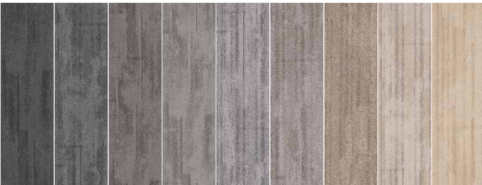
SKANDI TROSA 100 SKANDI TOVA 200 SKANDI TORI 300 SKANDI ODENSE 400 SKANDI IDDA 500 SKANDI TALE 600 SKANDI NATTI 700 SKANDI WINIE 800 SKANDI FLEN 900