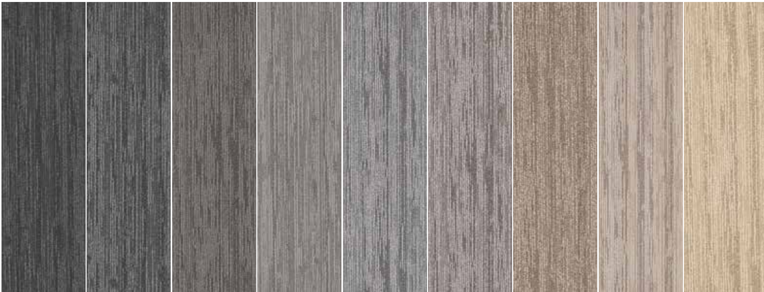
MALMO ZAIDE 100 MALMO JETTE 200 MALMO NIRI 300 MALMO MAJA 400 MALMO KARLA 500 MALMO RAKEL 600 MALMO ANNELI 700 MALMO GALA 800 MALMO DANA 900